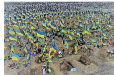
A Cemetery near Kyiv