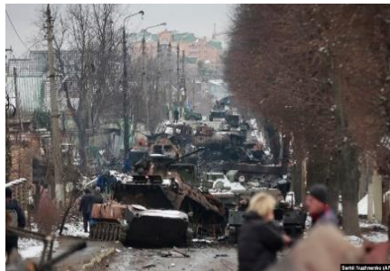
Destroyed Russian tanks near Kyiv

Battle for Kyiv: When the Russian army invaded from the north, Ukrainian troops, civilians and volunteers mobilized and headed for the forests and Pripyat swamps to meet the tanks and APC’s. Ukraine used Javelin missiles supplied by the USA /NLAW by the UK which destroyed Russia’s tanks and crushed the Russian army in the early days and weeks of the war, forcing the Russians to retreat back to Belarus.