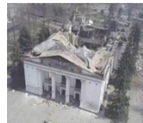
Destroyed Mariupol theatre

Destruction of Mariupol is the coastal city on the Azov Sea that the Russians carpet bombed and destroyed. The city had a pre-war population of 500,000 . Estimates of the dead from Russia’s bombing campaign alone are estimated at over 80,000-100,000 . One publicized incident involved the Russians deliberately bombing the Drama Theatre with missiles , where it was estimated that over 600 women and children were killed. Since Russian occupation many more have been killed.