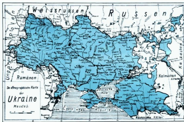
Map of Ukrainian speaking lands

Following the outbreak of the Russian Revolution and the demise of the Russian Empire, an Independent republican government was formed in Ukraine, headed by the "Central Rada," on January 22, 1918.