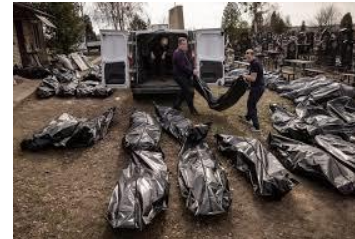
Bodies exhumed from mass graves in Buch

Destruction of Mariupol is the coastal city on the Azov Sea that the Russians carpet bombed and destroyed. The city had a pre-war population of 500,000 . Estimates of the dead from Russia’s bombing campaign alone are estimated at over 80,000-100,000 . One publicized incident involved the Russians deliberately bombing the Drama Theatre with missiles , where it was estimated that over 600 women and children were killed. Since Russian occupation many more have been killed.